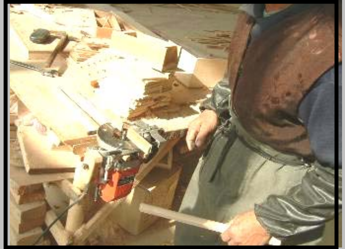
Drill lather (2pcs)