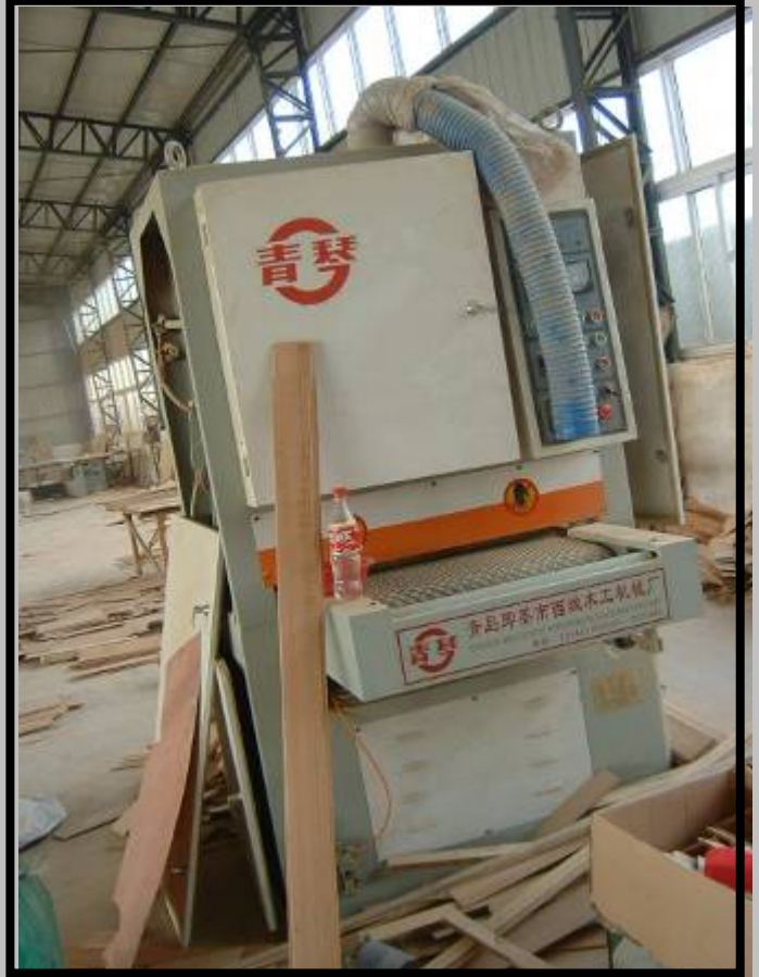
Polish machine (1pc)