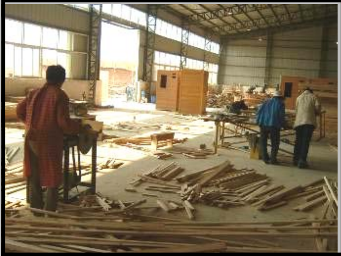
Cutting little board