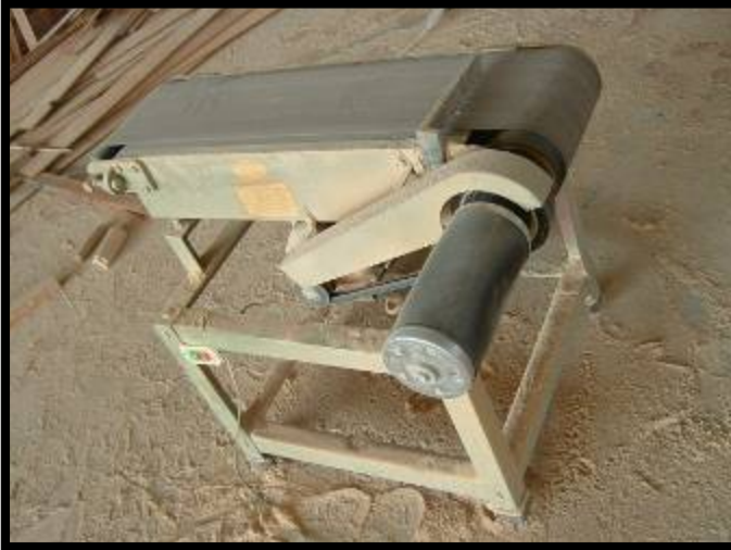
Small polish machine (2pcs)