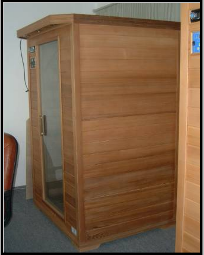
In office meeting room