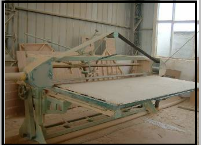
Big polish machine (2pcs)