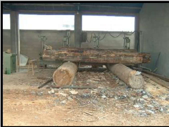
Cutting machine (1 pc)