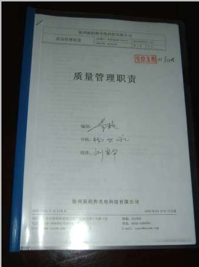
Quality system management