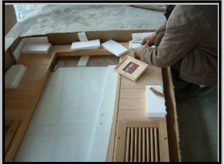
Power appliance assembly