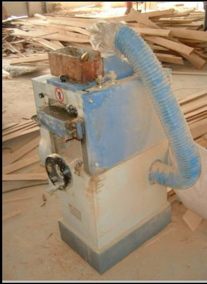
Miller machine (2pcs)