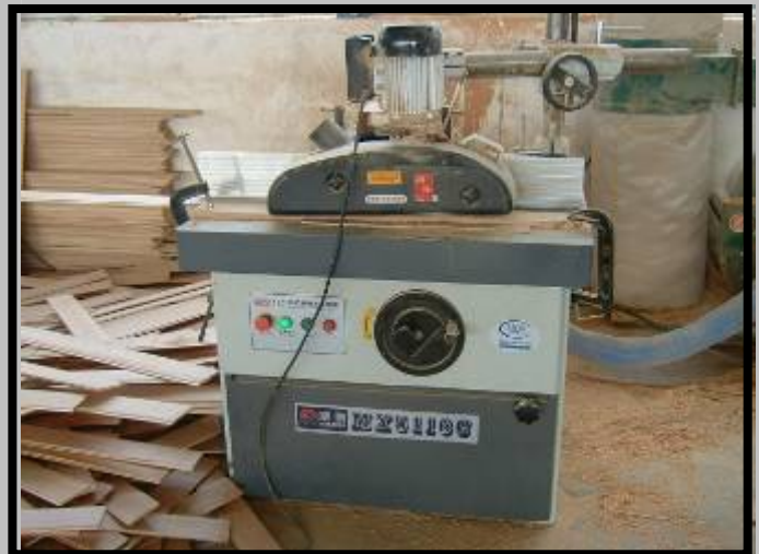
Press planer (2pcs)