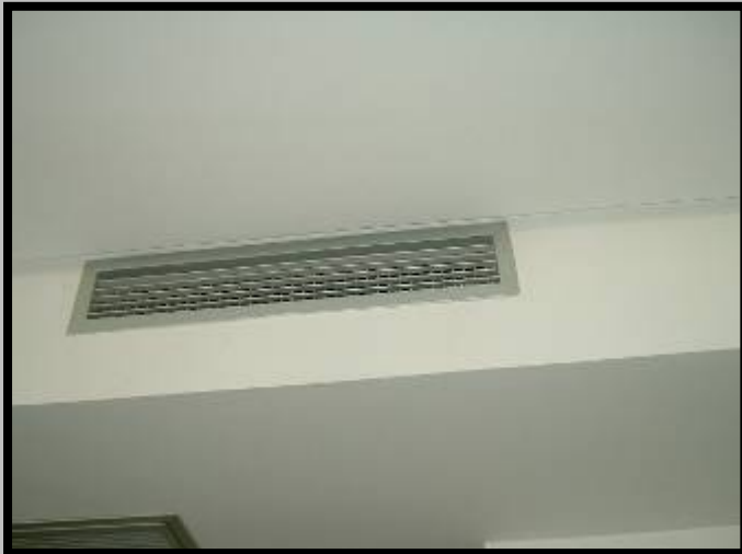
Air conditioning / Ventilation