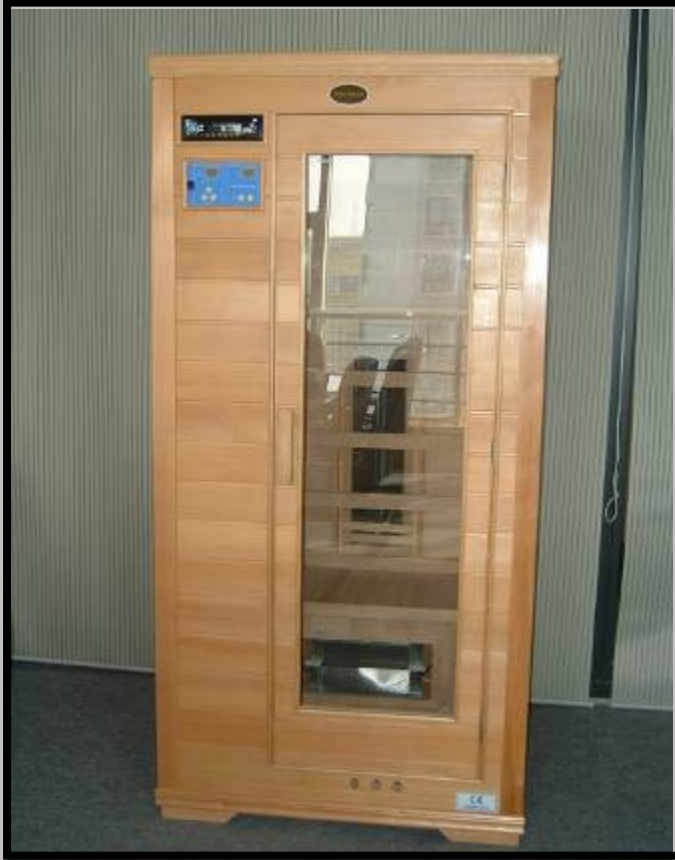
Sample room condition