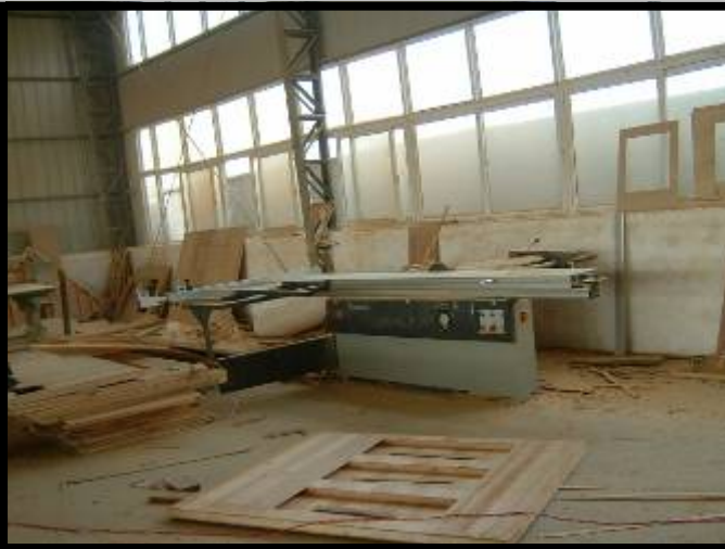
Navigation saw (1pc)