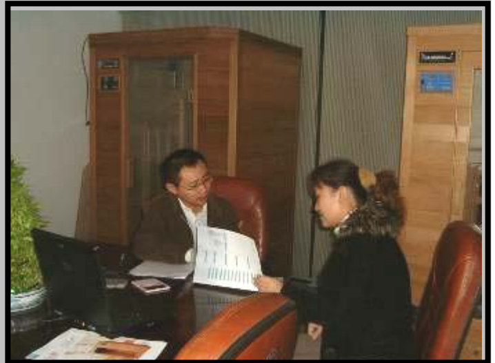
QC staff with workers